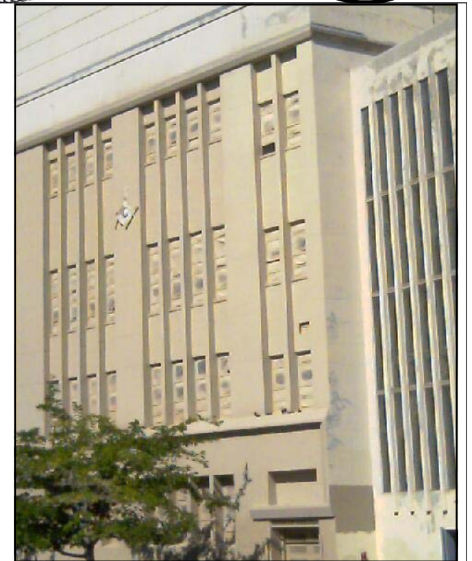
Reno Lodge is getting an exterior face lift. The building is being painted tan.